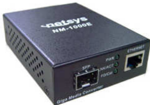
NM-1000E Giga media converter

NETSYS is a trademark of National Enhance Technology Corp. The information given in this document shall in no event be regarded as a guarantee of conditions or characteristics. With respect to any examples or hints given herein, any typical values stated herein and/or any information regarding the application of the device, National Enhance Technology Corp. hereby disclaims any and all warranties and liabilities of any kind, including without limitation warranties of non-infringement of intellectual property rights of any third party.