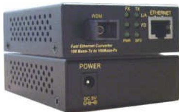
NM-102KIT 10/100M media converter